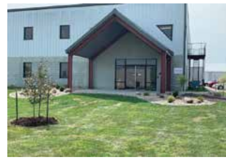
Our facilities in Georgia and Iowa